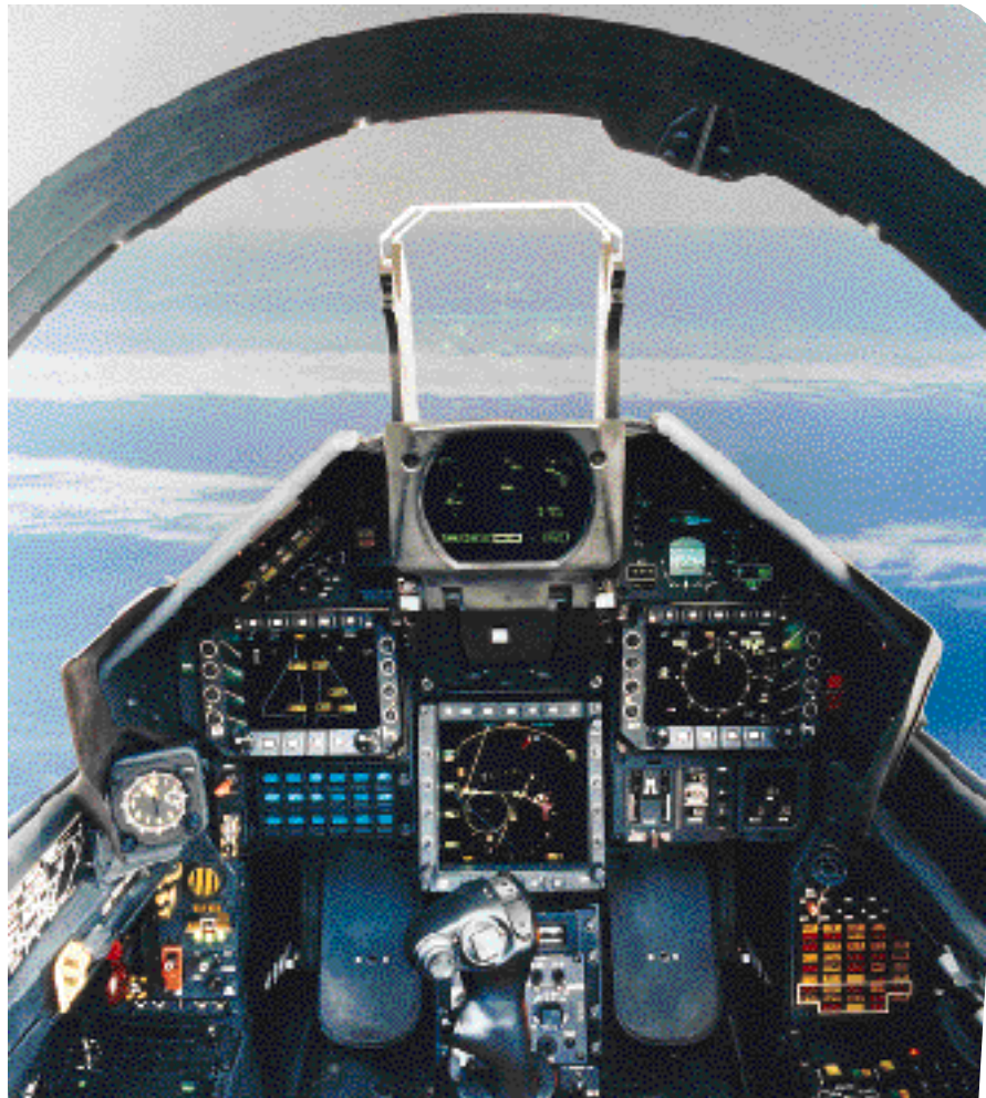
Cockpit of a French Mirage 2000-5.

◆ The mission planning system comprises a workstation with a high-resolution 20-inch monitor, an MCM rack (Moyen Chargement Mémoire) to interface with the aircraft, a printer and two uninterruptible power supplies. All these elements are integrated inside self-supporting units, thereby facilitating deployment. Sogitec, already closely involved in developing data formatting software, is supplying the portable Judy units and MCM racks. Each rack comprises an MBM drive and six slots for programmed electronic warfare memory modules (MIP GE). Pilots can access the information stored in the MBM in flight and in real time during all phases of the mission—be it an escort or air superiority mission—in coordination with other aircraft.